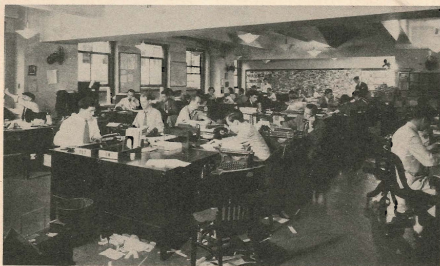
RADIO CITY HEADQUARTERS OF NBC'S INTERNATIONAL DIVISION WHERE WARTIME SHORTWAVE BROADCASTS ARE BEING PREPARED.

COMPLETE GUIDE-BOOK FOR SHORT-WAVE LISTENERS